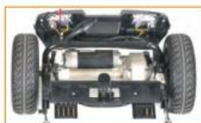
Quiet & maintenance-free motor