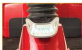
Angle adjustable LED headlight creates a wide path of bright light