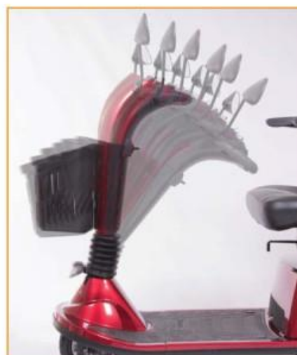
Patented infinite adjustable tiller