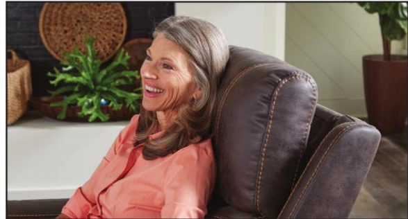
Adjustable Headrest and Lumbar

The Titan comes standard with the following comfort and convenience features: