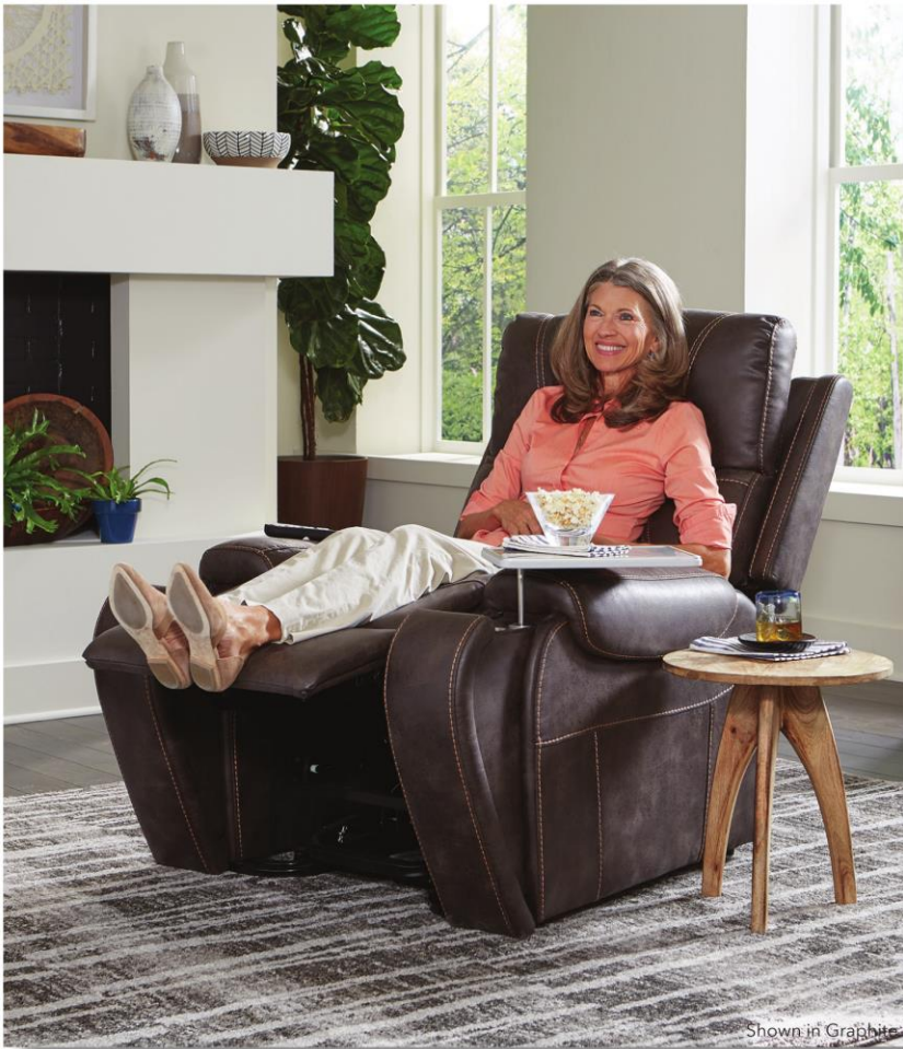
Shown in Graphite