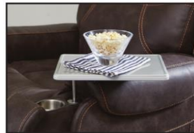
Accessory Mount with Removable Table