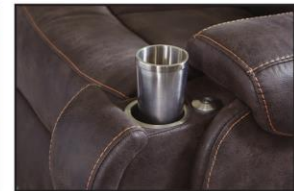
Built-in Cup Holder